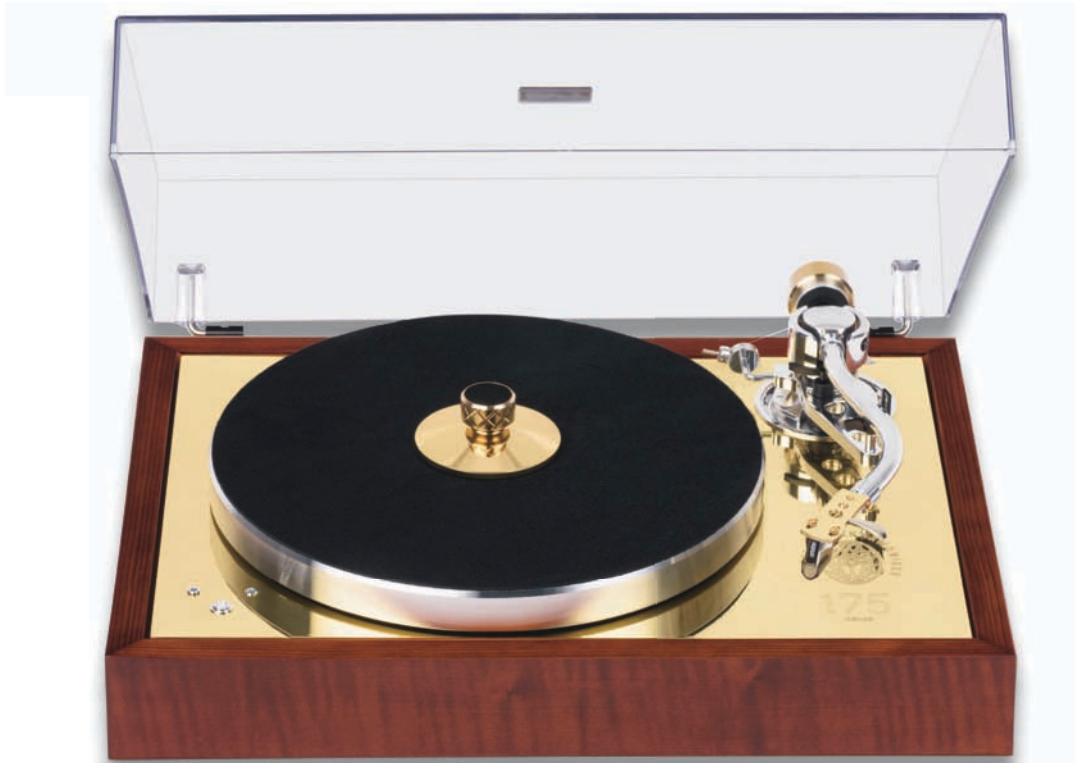
Wood Chassis in Dark Cello