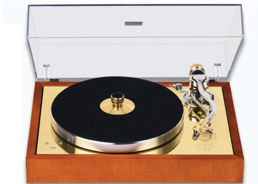
Wood Chassis in Bright Violin